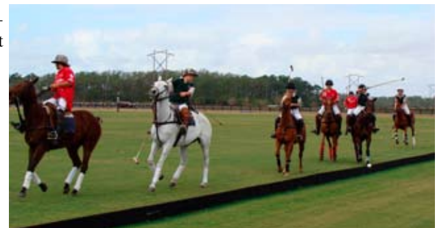
Hobe Sound Polo Club hosted Junior Polo every Saturday morning in April.