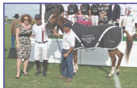
Mini Bank, BPP, Gold Cup