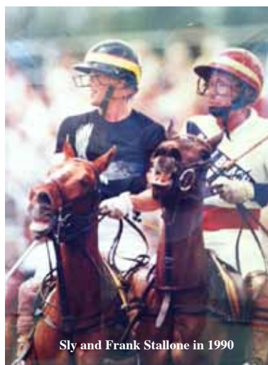
Sly and Frank Stallone in 1990