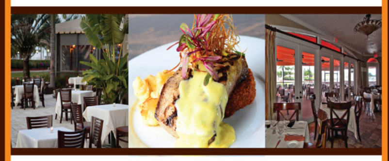
Specializing in Private Parties 🚺 Dutside Dining Available