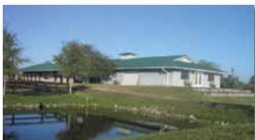
LA POLO FACILITY

Includes Membership in the S 40 Polo Club w/ Tournament Polo Field, Stick & Ball Field, 5/8th Mile track and training area