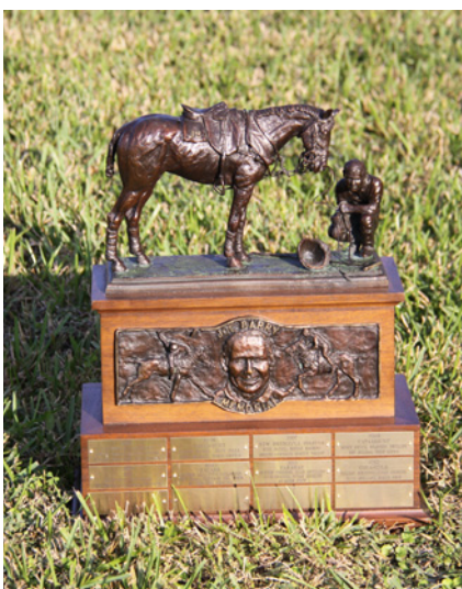
The Joe Barry Trophy