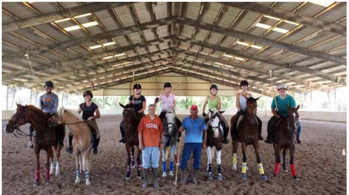
July Retama Polo Lessons Group