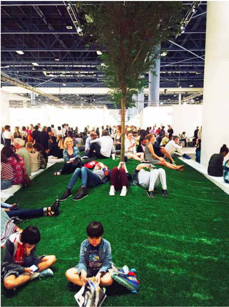
Above, a rest area at Art Basel, 2015

Continued from page 4 ates a meaningful dialogue between artists, galleries and collectors while providing the ultimate platform for the presentation of mid-career, emergent and cutting-edge talent by emerging and established galleries. The combined efforts of CONTEXT Art Miami and Art Miami provide a unique and alternative opportunity for leading primary dealers and their artists.