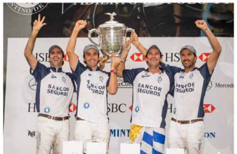
Team La Dolfina with, from left, Juan Martin Nero, Pablo Mac Donough, Pelon Stirling and Adolfo Cambiaso won its 3rd consecutive Polo Triple Crown in Argentina in December. Adolfo Cambiaso will return to IPC in 2016 with Valiente and newcomer Dubai.