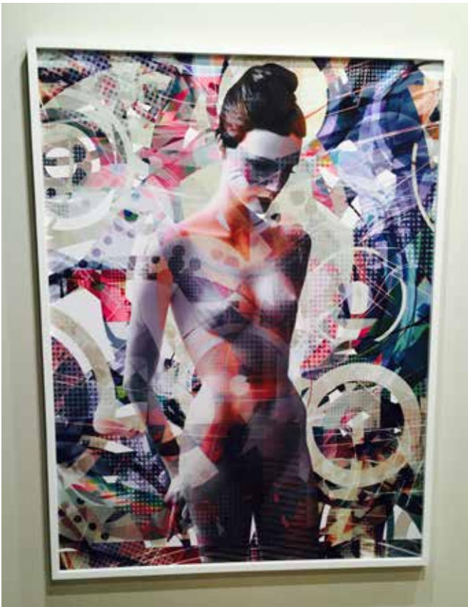
Saffron, by Valérie Belin

A celebrated artist both side of the Atlantic, Valérie Belin had a solo exhibition at Centre Georges Pompidou earlier this year with new work Les images intranquilles (Unquiet Images.) The series had its first presentation in the United States, first at the Edwynn Houk Gallery in New York October 22 through Dec. 19, and at Art Basel early December. (Picture above)