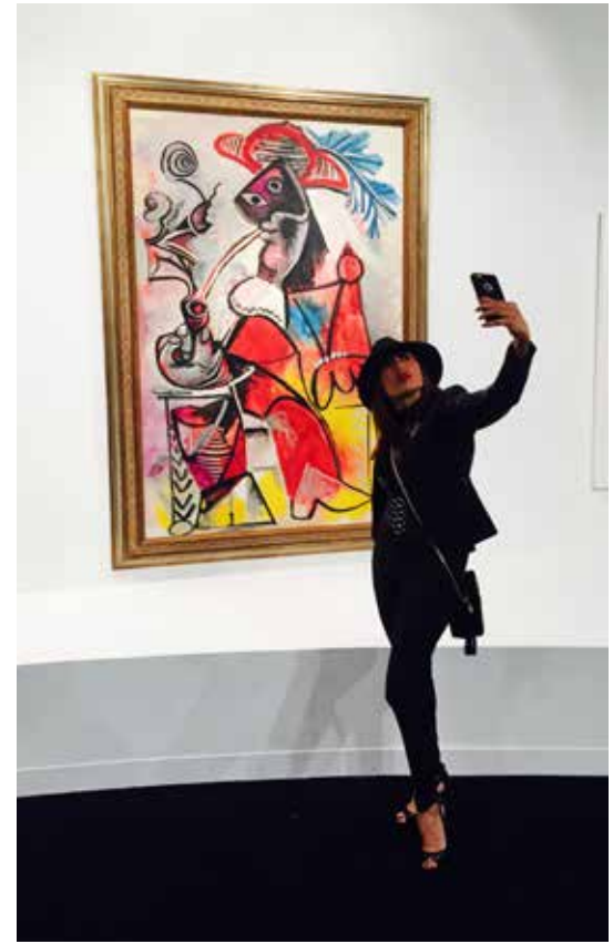
Selfie on a Selfie

Compared with its early years, Art Basel in Miami Beach has changed considerably. The leading worldwide art fair with its European Fair in Basel (June 16 – 19, 2016) and its Asian Fair in Hong Kong (March 24 – 26, 2016), Art Basel Miami was previously often about flashy bling. In this year's edition, from sophisticated Art Basel for the cultural connoisseur, to graffiti-clad Wynwood for the emerging muralists ( Street Art, see page 6 ), Miami has something for everyone. It's also the time of year when Miami's own museums and galleries present their most compelling work.