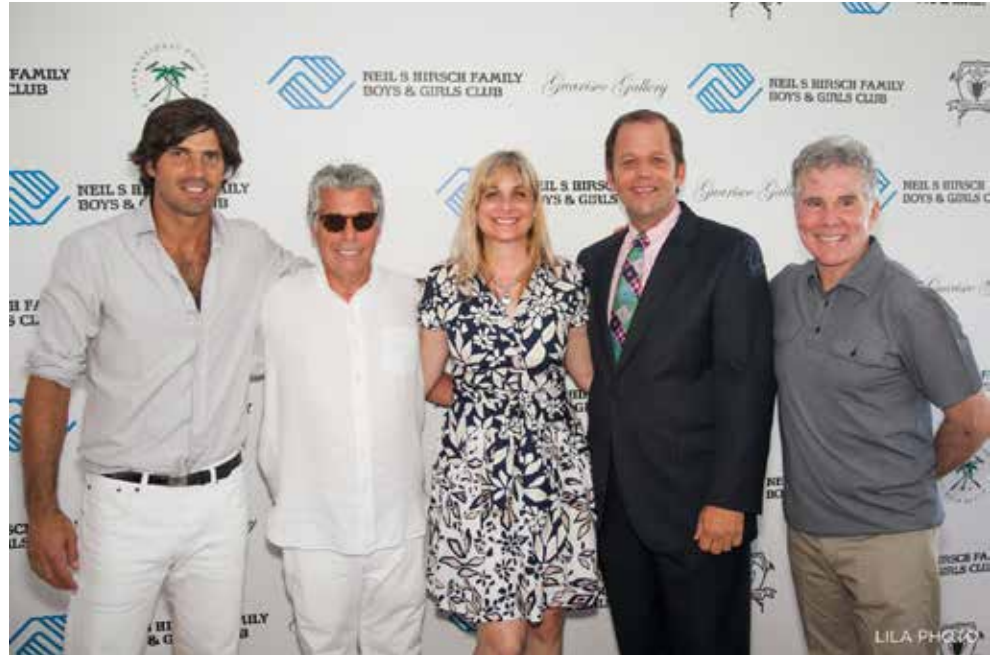
When the star power of polo icon, Ignacio “Nacho” Figueras, and America’s Most Wanted host, John Walsh, partnered as the honorary event chairs for a fundraiser to benefit the Neil S. Hirsch Boys & Girls Club in Wellington, the tables went quickly for the March 15, 2015 event. Revenue reports showed that the event surpassed the previous year’s proceeds of $175,000 by a strong margin.