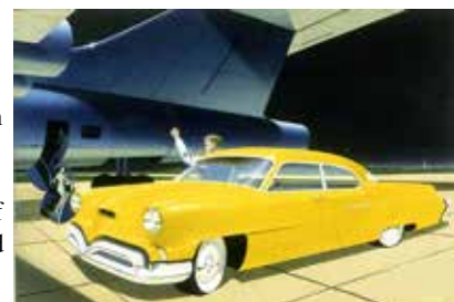
Allan Phillips, Mercury Carnival , 1952

to another. Featuring more than 200 items, including design drawings, concept sketches, renderings, advertising art, and posters, as well as model trains, planes, and automobiles.