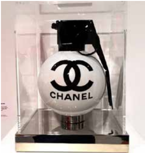
"Pull the Pin, Chanel," by Bruce Makowsky

Belin's series does not aim to present the Super Models as what they are, but instead as what they are not, and through the complete artificial state of the images the artist ultimately calls into question ideas of vanity and the delicate nature of human existence.