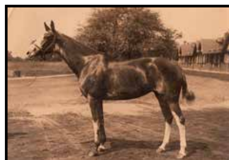
Horses to Remember - Gargantilla.