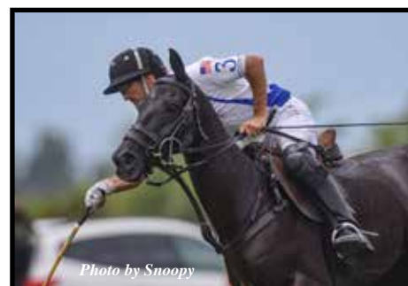
Horses to Remember - Wembley